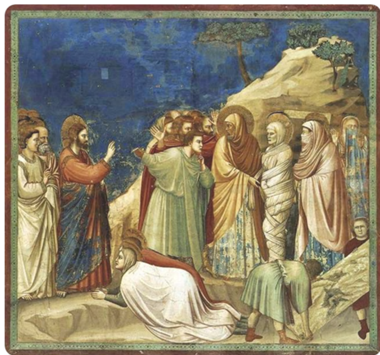
The Raising of Lazarus, 1304-06, Giotto di Bondone (c. 1266 –1337).